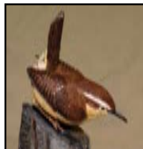
Carving