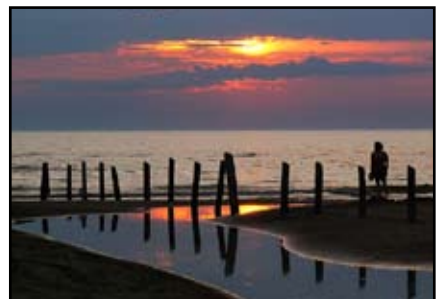
Yvonne Boniface End of the day

I took this picture last summer (2009) while vacationing at Sauble Beach. The sunsets are beautiful there, so I waited one night (with my tripod) for just the right moment. I had to wait for the evening walkers to clear -