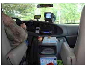
Discovering subjects to photograph. GPS, map, camera, Tim Hortons and off I go!