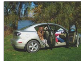
My car and my dog, travel, photography, outdoor adventures. Bronwyn Moody

Project #3 - "What's in the Bag" IMAGE DEADLINE JANUARY 4th Please send your digital image to contest@woodstockcameraclub.com Code: PC#3-yourlastname-your first name Instructions on the WCC website