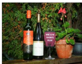
Gardening, photography, outdoor entertaining and a nice glass of wine. Kim Eller